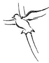
National Association of Health Care Chaplains