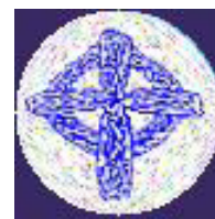
Association of Clinical Pastoral Education (Ireland) Ltd