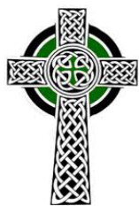
The Healthcare Chaplaincy Board